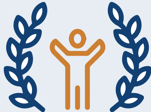
À la carte Sponsor