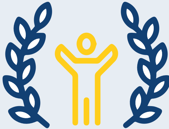
Key Event Sponsor